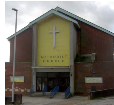
St BUDEAUX METHODIST CHURCH